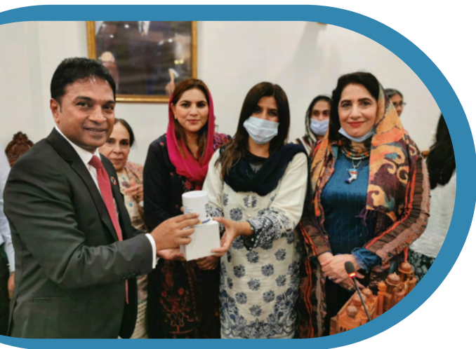
Study tour to Pakistan, 2022

In 2022, following a successful study tour of the Sri Lankan multistakeholder VNR delegation to Pakistan, an innovative peer review workshop was held online. The success of the peer review workshops was underpinned by the connections made during the study tour. The countries provided frank and constructive feedback on each other's VNR drafts in an online workshop facilitated by ESCAP. They completed the Twinning Programme by presenting their VNRs side-by-side at the HLPF and asking questions to their peers.