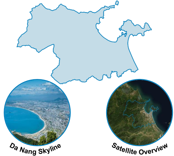
Da Nang Skyline