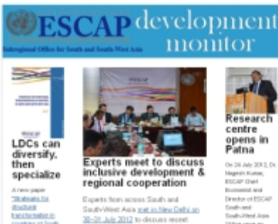
Number 7, August 2012