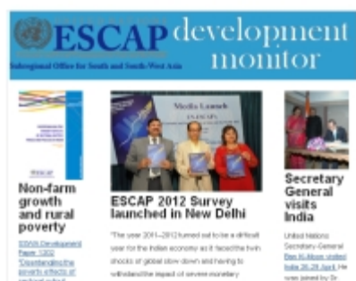
Number 4, May 2012