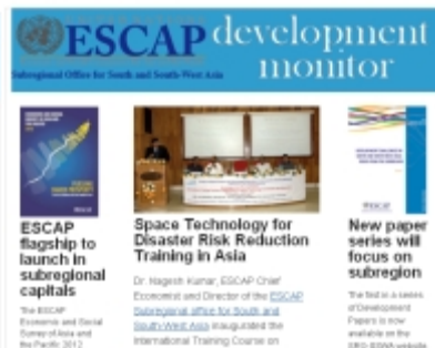
Number 3, April 2012