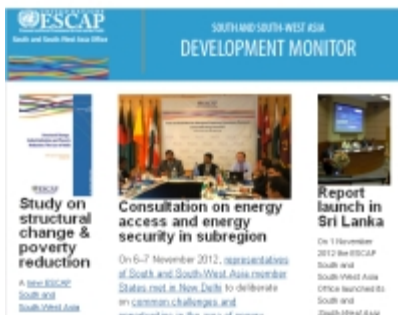
Number 10, November 2012