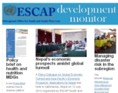
Number 6, July 2012