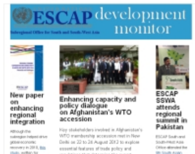
Number 8, September 2012