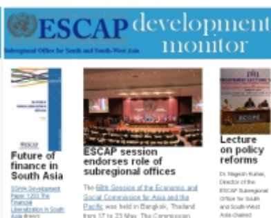
Number 5, June 2012