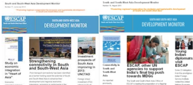
Number 17, June-July 2013