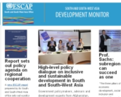
Number 9, October 2012