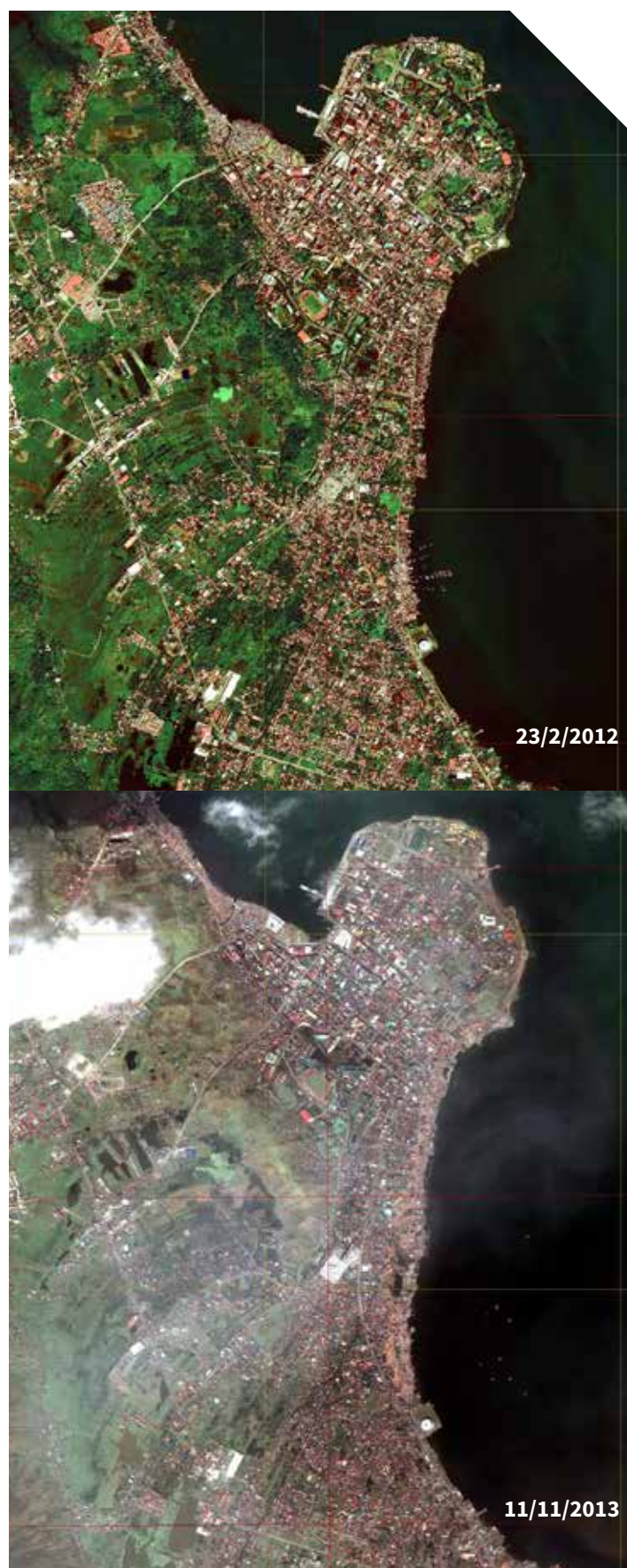
BEFORE AND AFTER TYPHOON HAIYAN, PHILIPPINES

The ESCAP Regional Space Applications Programme for Sustainable Development (RESAP) strengthened the capacities of member States in the effective use of space technology and geo-referenced information systems for disaster risk reduction. Over the past two years ESCAP has trained nearly 400 policy-makers and practitioners from more than 30 member States, and in 2013 ESCAP provided more than 150 near real-time satellite imagery and damage maps to disaster affected countries.